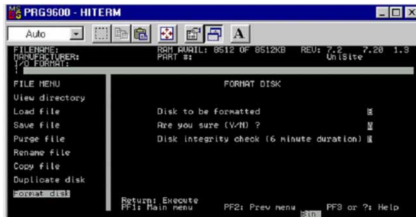
FORMAT DISK screen