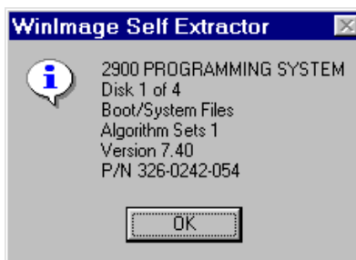
Status window describing disk contents